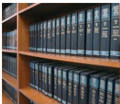
CATALOGUE HISTORIQUE ET DESCRIPTIF DU MUSÉE DE DIJON: PEINTURES, SCULPTURES, DESSINS, ANTIQUITÉS...

Download Full Pages Read Online Catalogue Historique Et Descriptif Du Musée de Dijon Catalogue Historique Et Descriptif Du Musée de Dijon Peintures Sculptures Dessins Antiquités Clic Reprint French Edition Musee Des