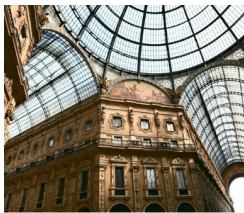
CATALOGUE HISTORIQUE ET DESCRIPTIF DU MUSÉE DE DIJON: PEINTURES, SCULPTURES, DESSINS, ANTIQUITÉS

Available link of PDF Catalogue Historique Et Descriptif Du Musee De Dijon